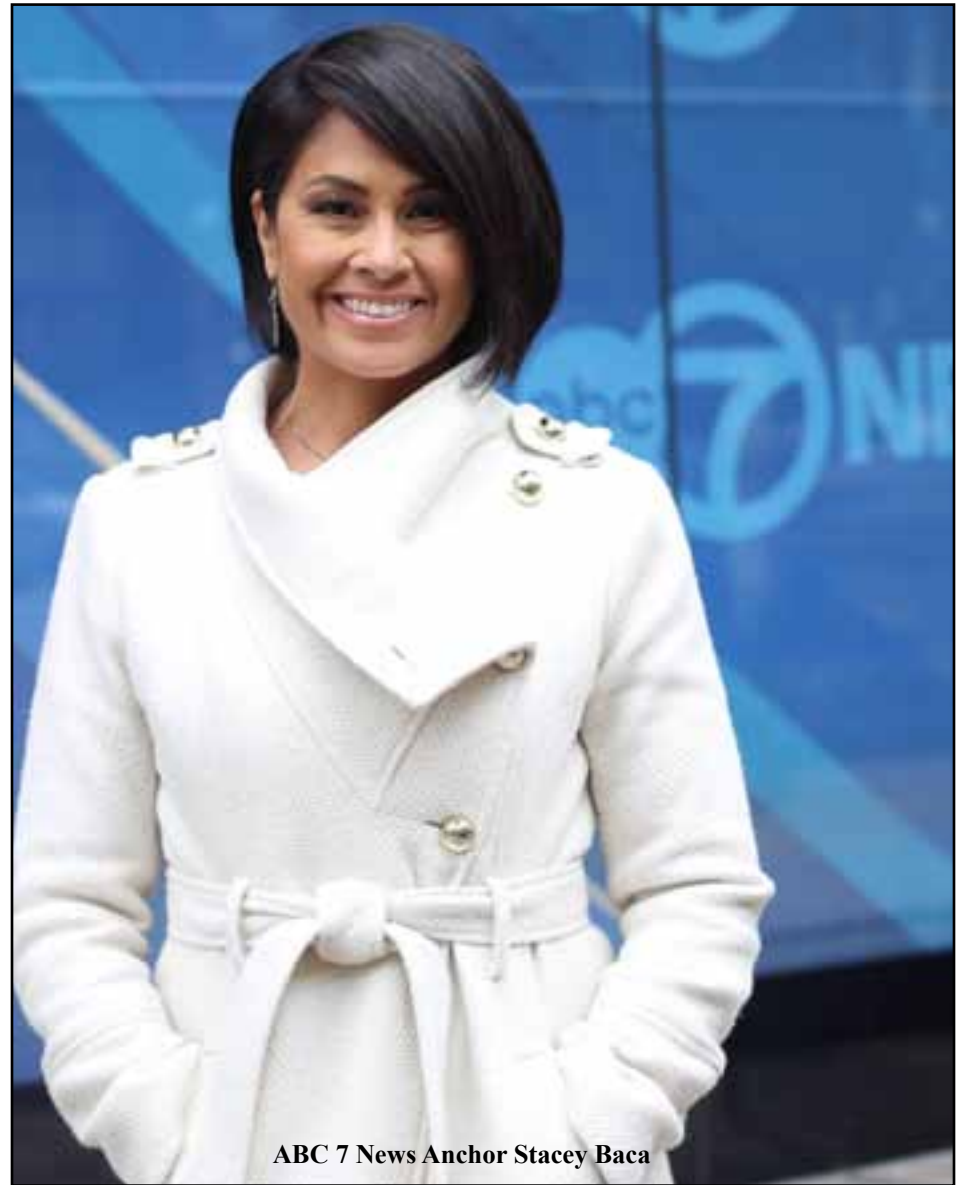
ABC 7 News Anchor Stacey Baca