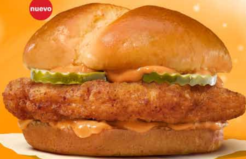
Spicy Crispy Chicken Sandwich