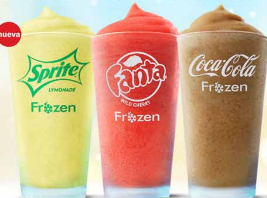
Frozen Carbonated Beverages