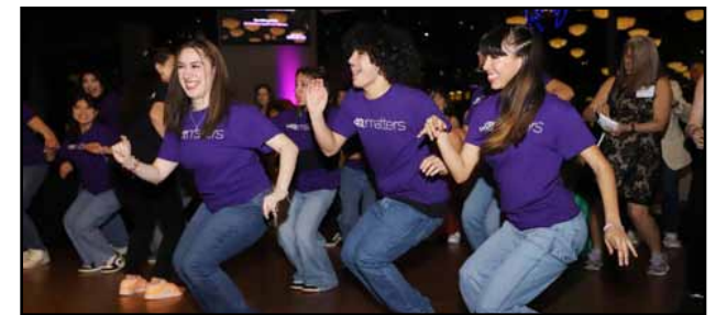
Arts program worked with guests hands-on.