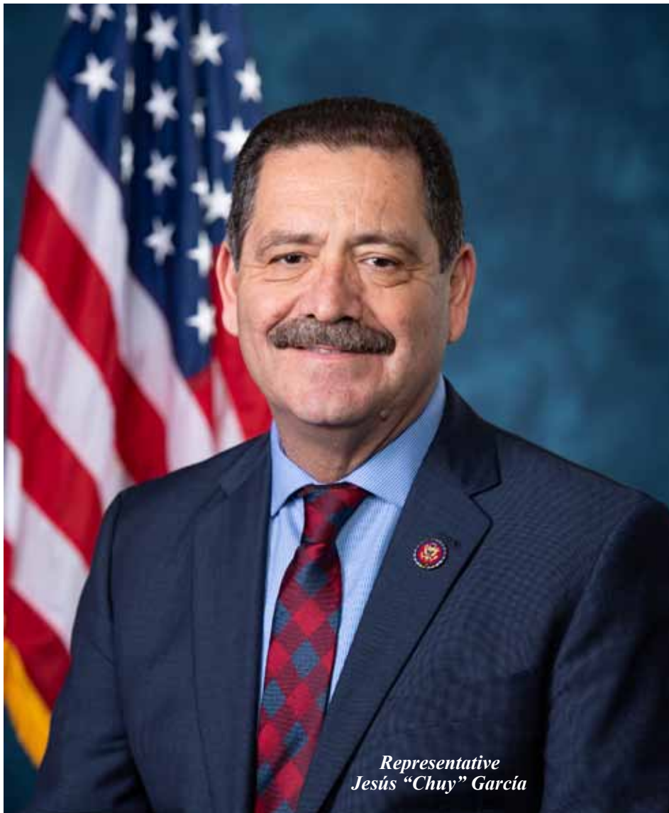
Representative Jesús "Chuy" García

Safe Housing for Kids Act , which would require the U.S. Department of Housing and Urban Development (HUD) to update its lead poisoning prevention measures to reflect modern science and ensure that families and children living in federally-assisted housing are protected from the devastating consequences of lead poisoning. Lead hazards in a home pose serious health and safety threats. According to the Centers for Disease Control and Prevention (CDC), lead hazards such as dust and chips from deteriorated lead-based paint are the most common source of lead exposure for U.S. children. A 2021 survey conducted by the U.S. Department