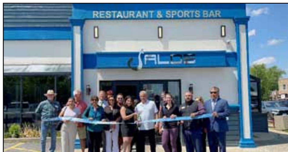
Jalos Restaurant Sports Bar & Grill celebrated a grand opening on May 23rd.

follow her dream and return to her roots by opening her own restaurant. Jalos Restaurant Sports Bar & Grill is the fruition of this dream, offering a vibrant and welcoming atmosphere for the community to enjoy. Jalos prides itself on offering a diverse menu that caters to a variety of tastes. Whether you are looking for a place to enjoy a family meal, watch your favorite team, or simply relax with friends, Jalos provides the perfect setting. You can find Jalos