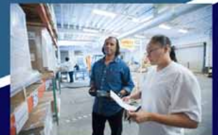
Shipping & Receiving