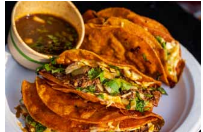
X and Instagram.

events in Pullman Park (11101 S. Cottage Grove Ave) on Saturday, August 17 from 12 - 8 p.m. leading up to Taste of Chicago in Grant Park. Full vendor and entertainment lineups at TasteofChicago.us. As always, admission to Taste of Chicago is free. For more information, visit TasteofChicago.us, and follow on Facebook and