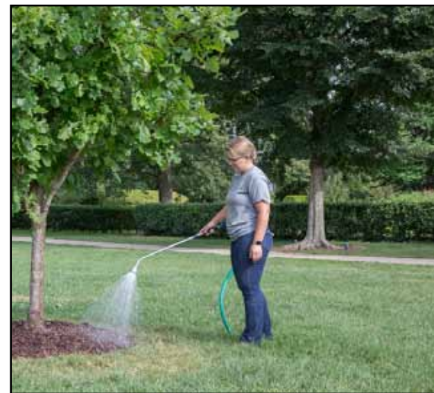
More information about how to water trees and shrubs and keep plants healthy amid the excessive heat is available on the mortonarb.org website.

Mulch. A layer of mulch over the roots of plants helps in two ways: It insulates the soil against extremes of temperature, and it prevents moisture from evaporating. Mulch can be applied at any time. Make a layer 1 to 2 inches deep on perennial beds and 3 to 4 inches around trees and shrubs. Spread the mulch out evenly, rather than piling it up against the trunk or stems. Try to keep mulch clear of the bark of a tree or shrub.