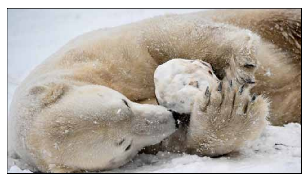
Brookfield Zoo Chicago invites the community to embrace New Year